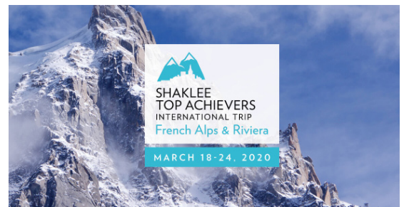
French Alps & French Riviera Top Achievers 2020