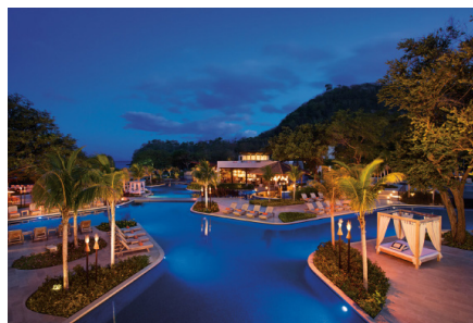
Costa Rica Resort Dream Trip 2020

Our 2020 trips. Qualify by sponsoring, increasing rank and promoting directors in your downline.