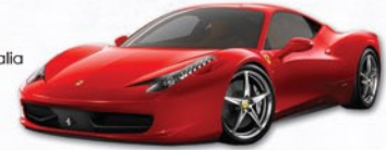
Ferrari 458 Italia

Winners will receive a Ferrari 458 or the car of their choice of equal or lesser value. Prizes are non-transferable.